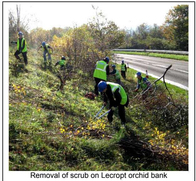
Removal of scrub on Lecropt orchid bank