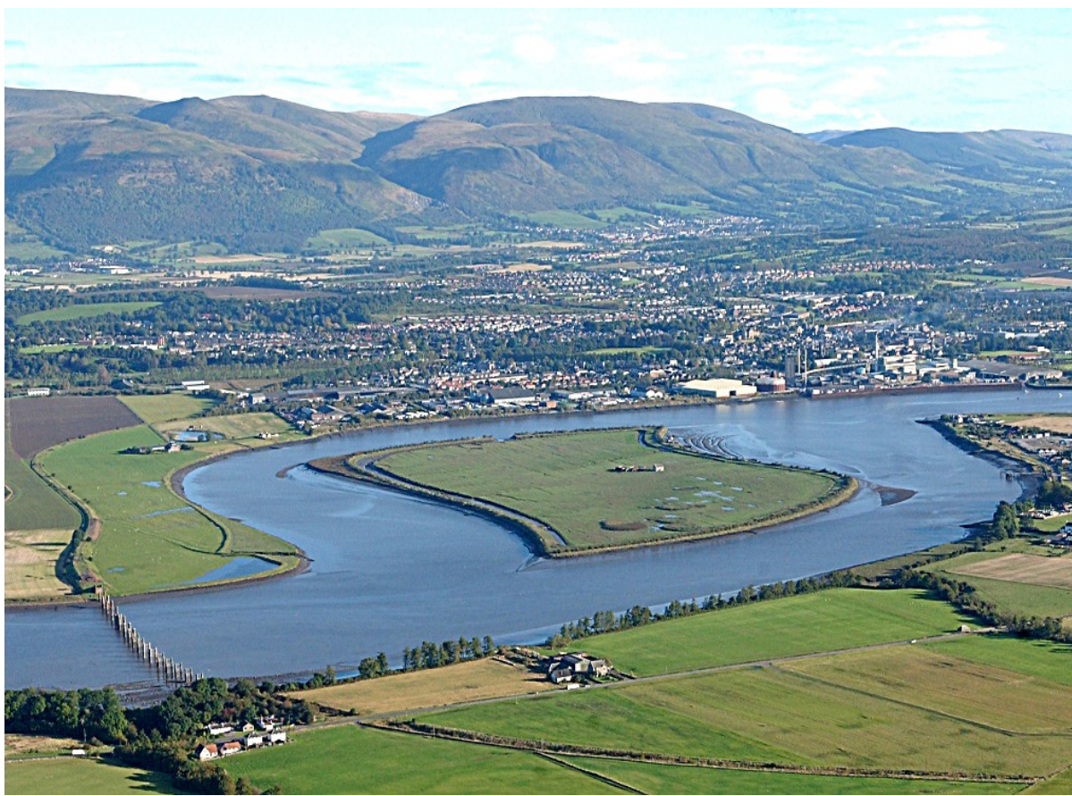
Alloa Inch (Centre)