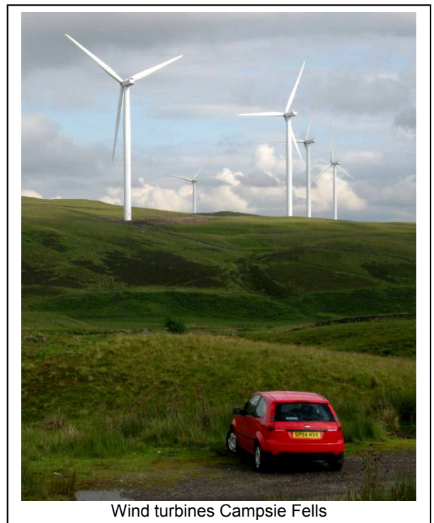
Wind turbines Campsie Fells