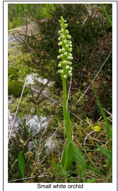
Small white orchid