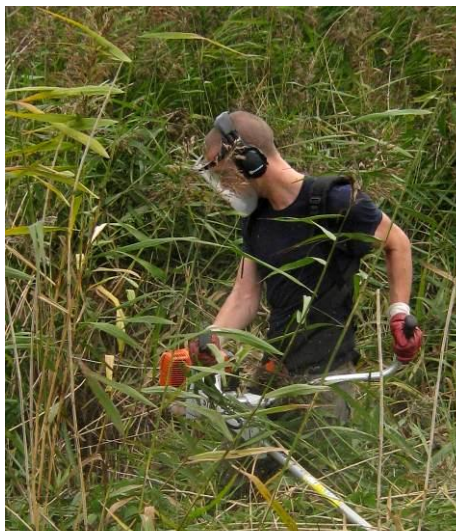
Strimming reeds at Cambus