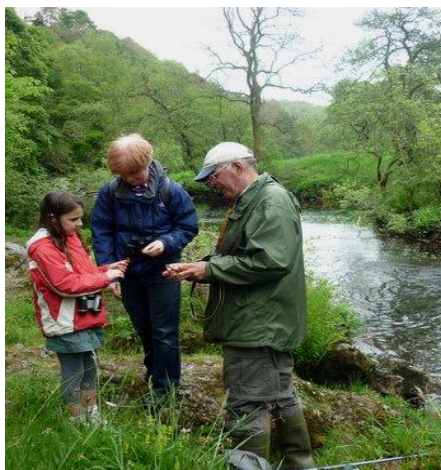
A walk in SWT's Carron Glen Reserve

Next year 2011-12 the Raploch Community Centre has been booked for our talks on the 1 st Tuesday in the month which will no longer clash with Callander SWT.