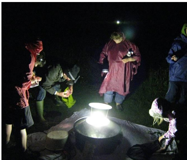
Families trapping the moths that pollinate butterfly orchids at Plean